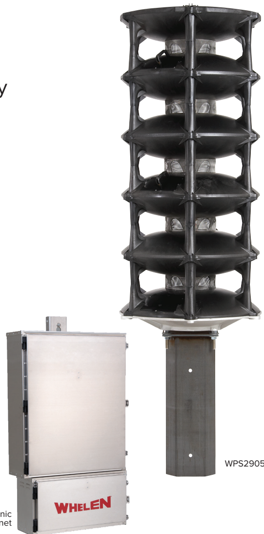
Type II Electronic Cabinet