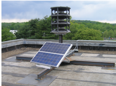
WPS2903 with both RTM Roof mount and SBC280 Solar Power Installation.

RTM - Roof mount and SBC280 solar power options.