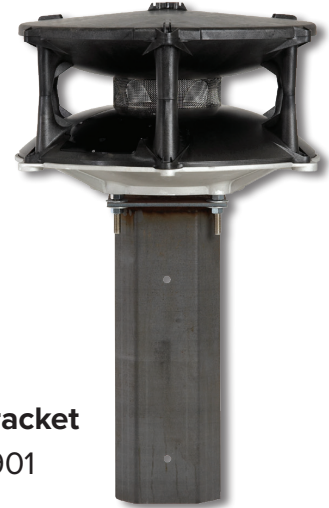
Pole Top Bracket with WPS2901