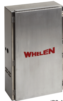
IPS 400/800 Type I Electronic Cabinet